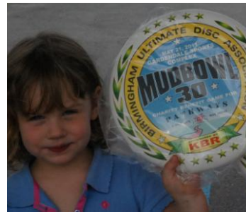
A young Mudbowl fan shows off the 30 th anniversary commemorative disc.

2011 Sporting Clays August 26 at Selwood Farms For more information, visit at www.pathwayshome.org